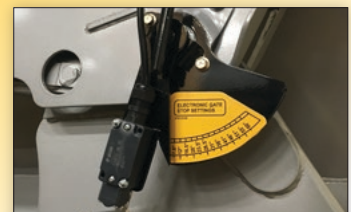
Patented Electronic Gate System (EGS)