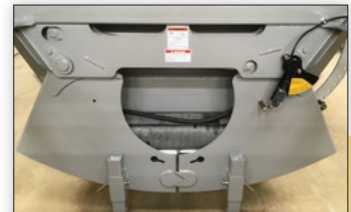
Internal Mount Front (Gate) Composite Cylinder