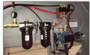
MAC Valve Works in Conjunction With EGS