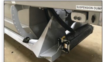
External Mount Rear (Gate) Cylinder Protected from Load & Discharge Damage