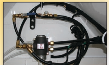
Cross Gates May Be Operated Individually or Simultaneously