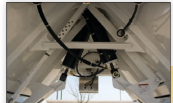
6" Composite Cylinders