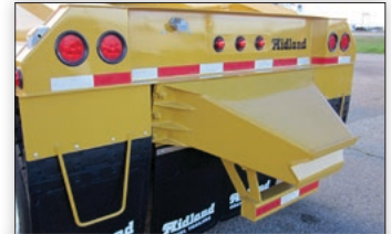
Optional Push Block With Under Run Bumper