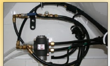
Cross Gates May Be Operated Individually or Simultaneously