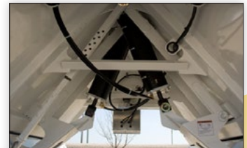
6 Composite Cylinders