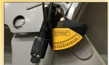
Patented Electronic Gate System (EGS)