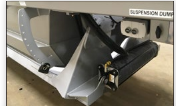
External Mount Rear (Gate) Cylinder Protected from Load & Discharge Damage