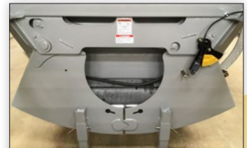
Internal Mount Front (Gate) Composite Cylinder