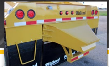
Optional Push Block With Under Run Bumper