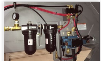
MAC Valve Works in Conjunction With EGS