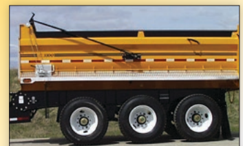
Aluminum Fenders on SK