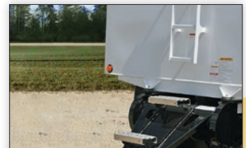
Easy Access Front Ladder with Aluminum Step Blocks