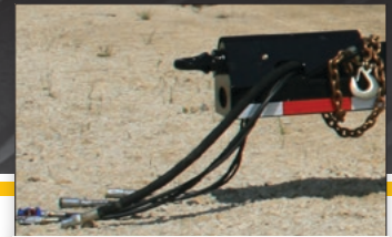
Shedding Pole; Protected Lines