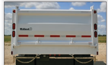
High Visibility Lighting