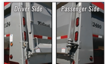
Side-Hinged Gate Option