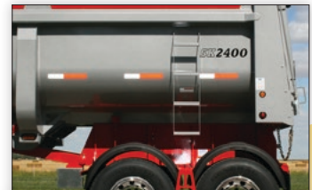
Easy Access Ladder (Standard)