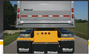
High Visibility Standard Lighting

Box 249 - 36 Main Street Rosenort, Manitoba Canada ROG 1W0 Phone: 1.800.827.7023 Web: www.midlandtrailers.com