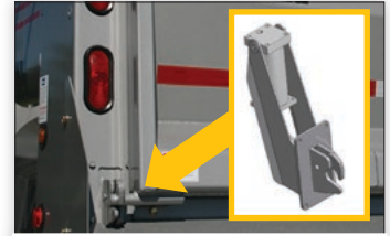
Unique Secure Tailgate Latch System