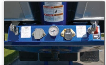
Heavy Duty Upper Coupler