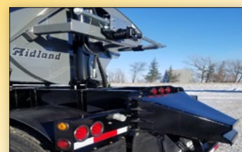
Heavy-Duty Bolt-On Push Block with Under Run Bumper