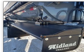
Durable Poly Self-Shredding Front Fenders