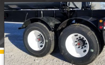
Durable Poly Half-Round Rear Fenders