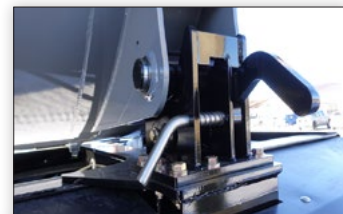
Secure Manual Latch System with Composite (Greaseless) Bushings