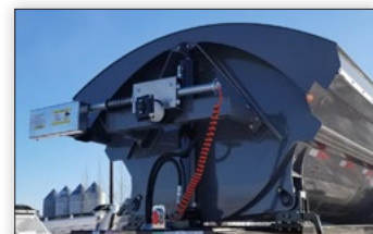
Optional Sidekick Mesh Tarp